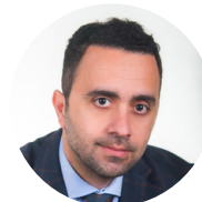
Constantinos Papalucas Coordinator of the National Hydrogen Committee Hellenic Ministry of Environment and Energy